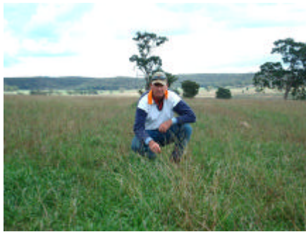
Jason Seis amongst a crop of "Yidda" oats sown directly into a native grass pasture. Photo taken April 2003.

The following photographs shows a crop of Oats sown directly into a perennial native grass pasture and then the commercially acceptable (3 tonne/hectare) grain crop being harvested.