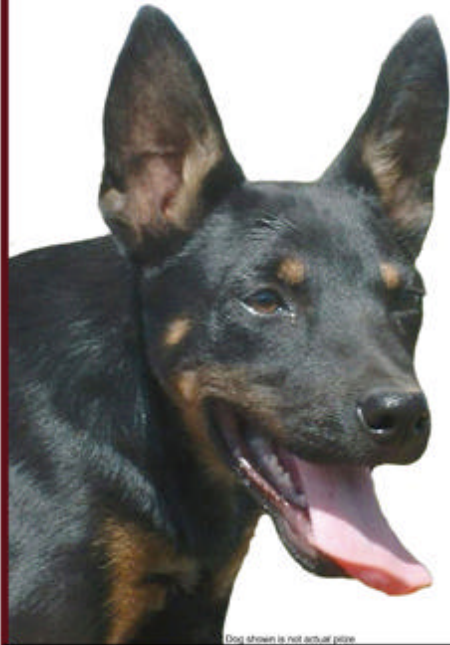
(Dog shown is not actual prize)