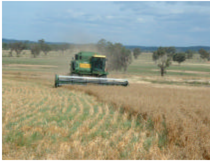
The same crop being harvested during December 2003. Notice the green grazable native grass pasture actively growing amongst the oats.