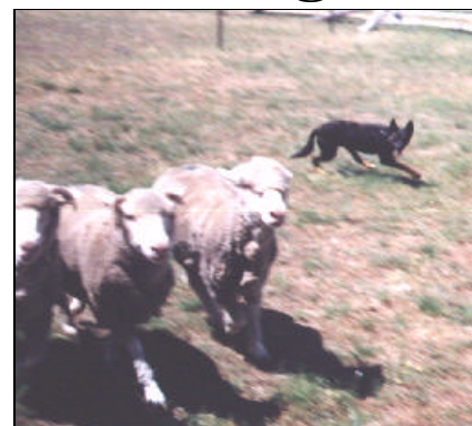
Winona Coke hard at work

their owners in a casual entertaining and learning day. Dogs are firstly evaluated and put into one of three groups depending on their level of ability. The day caters for all breeds of sheep dogs, beginners through to experienced dogs and those with problems