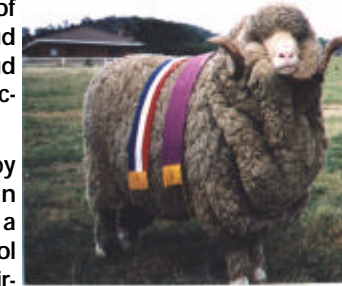
Winona Royal Snowy - sire of the award winners

This ram was described by noted stud breeders as an "excellent example of a broad crimping fine wool ram" and was sold after spirited bidding in the sale. A second similar ram was also sold to Roseville Park Stud.